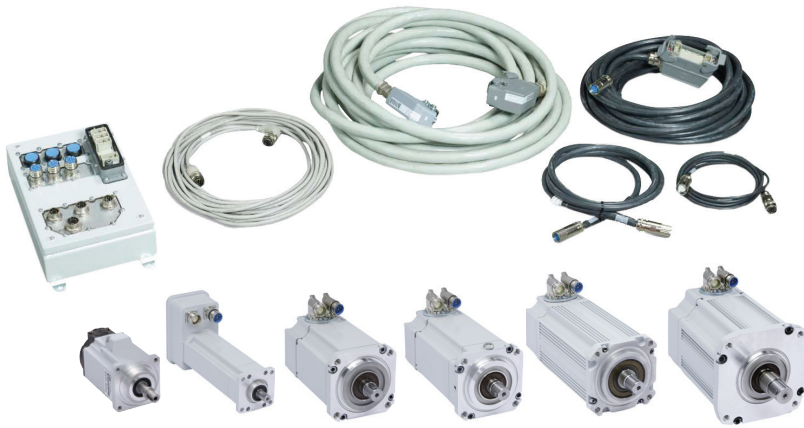
ABB is offering well-proven and pre-engineered motor unit packages that are more cost efficient and much easier to integrate with robots and robot controllers.